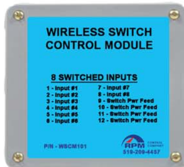
12 PIN WIRELESS SWITCH INPUT CONTROLLER