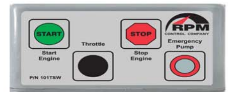
4 BUTTON MEMBRANE SWITCH CONTROLLER